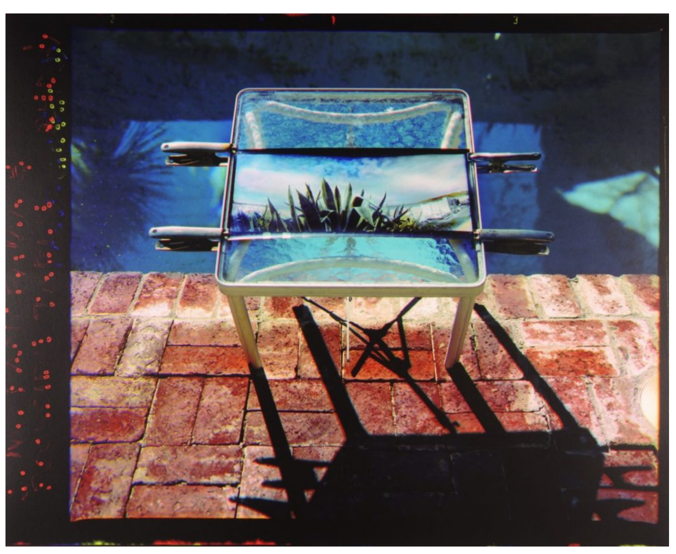
Darryl Curran (Courtesy of dnj Gallery)

My work examines the gap between the 19th and the 21st centuries. I follow the path of photographic mystery and discovery influenced by 19th-century practices and the magic of digital technology.